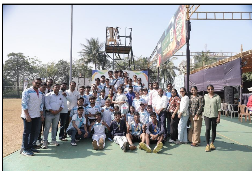
Sports Committee 2025 - 2026