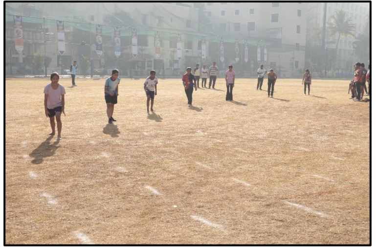
Track & Field Events