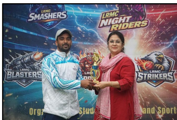
Man of the series