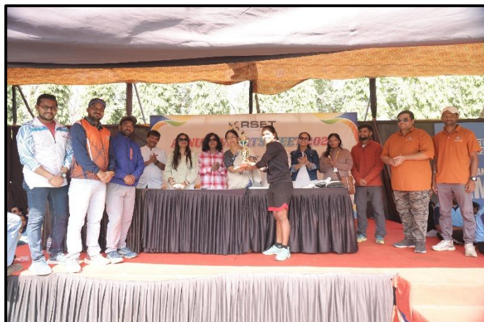
Best Athlete (Girl & Boy)