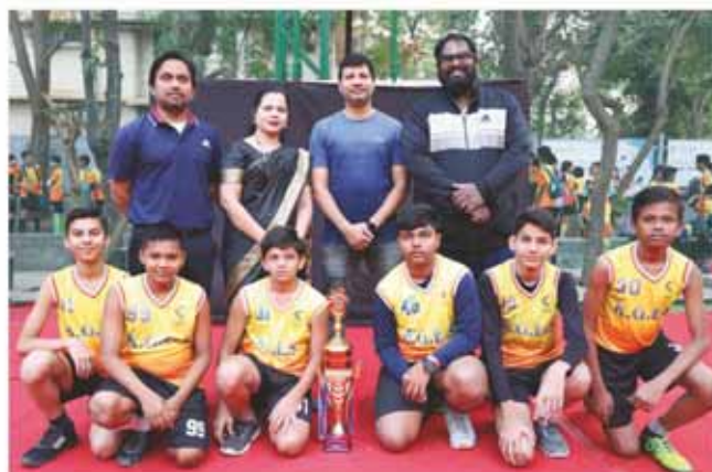
The U/16 Basketball Boys team displayed commendable performance, reaching the finals and claiming the runners-up position, a testament to their dedication and prowess on the court.