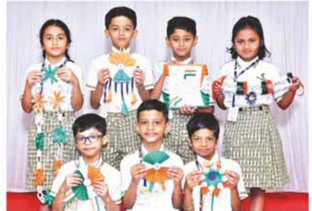
Tri- Color Competition