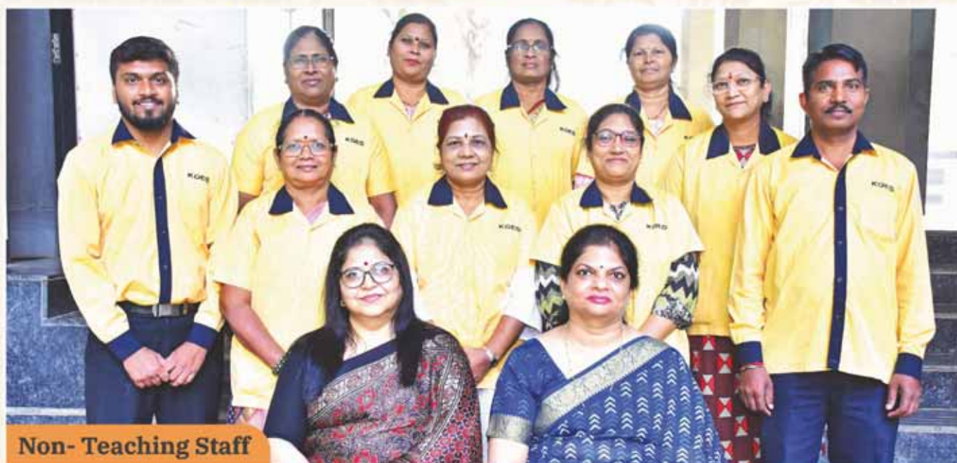
Non- Teaching Staff