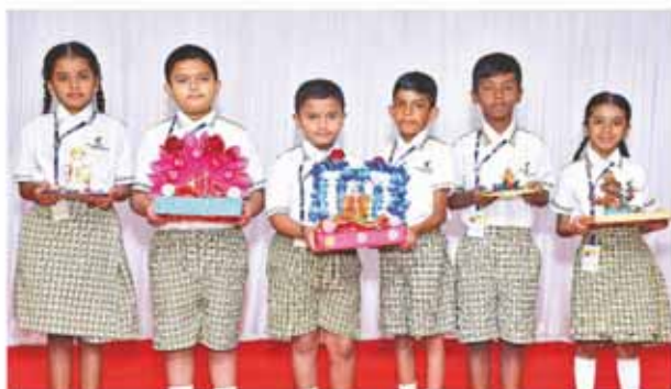
My Ganesha Competition