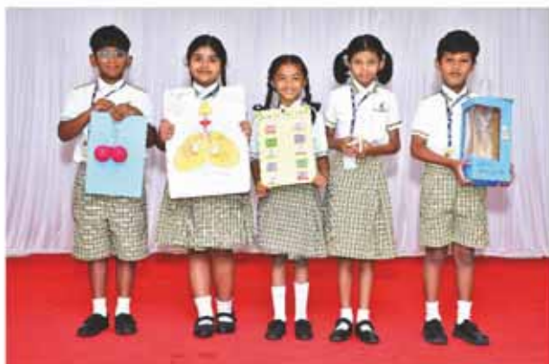
Model Making Competition