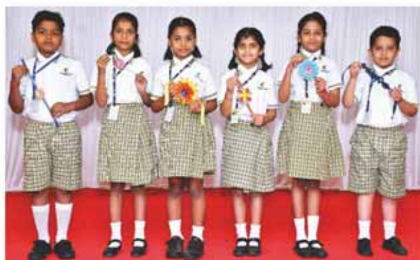
Rakhi Making Competition