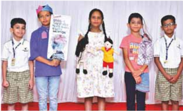
Little Poets Competition