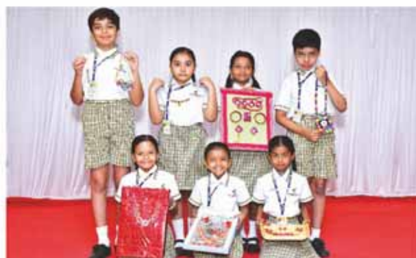
Own Your Ornaments Competition