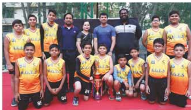
The U/14 Basketball Boys team emerged victorious, showcasing exceptional skills and teamwork throughout the tournament, securing their 1st Position as the champions of this league.