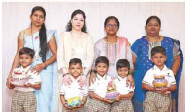
Pot Decoration Competition