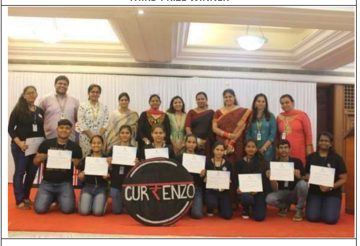
JUDGES FOR CURRENZO