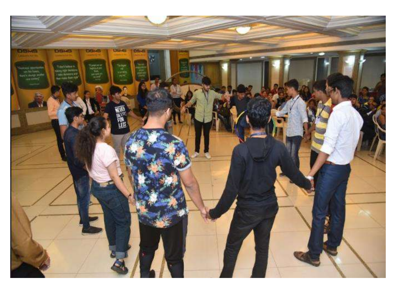
Management Session By CPL