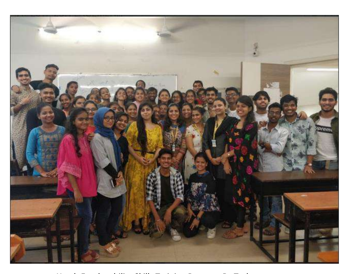
Youth Employability Skills Training Program By Technoserve