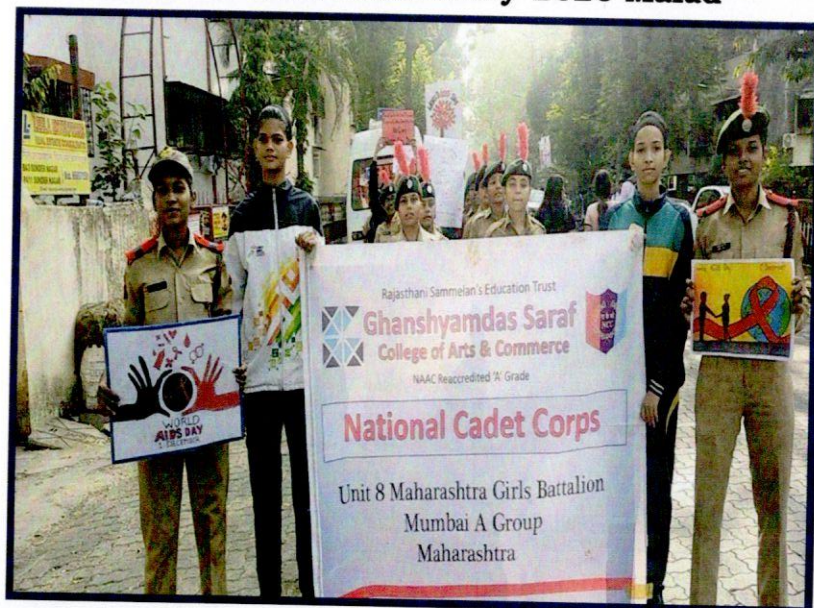
NCC Aids Awareness Rally 2020 Malad