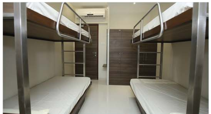
Quadruple Sharing Room