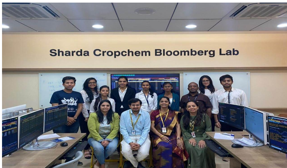
Students and teachers who completed BMC Course

6) Establishment of Research Cell of the University of Mumbai in the college:-The practice Taking into cognizance the growing importance of research and the need to channelize the research aptitude and skills of faculty members in the College, College has launched a Research Cell of Mumbai University in the College in the subject of Commerce and Economics. Further, the Cell has assisted young faculty members in preparation of synopses for research proposals to be submitted to the University where they are taking admissions to the Ph. D Programme. To promote research culture, the College has encouraged faculty members to participate in Research Conclaves