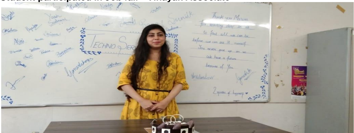
Session by Techno serve