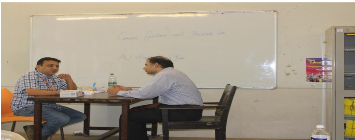
Interview by AU Bank