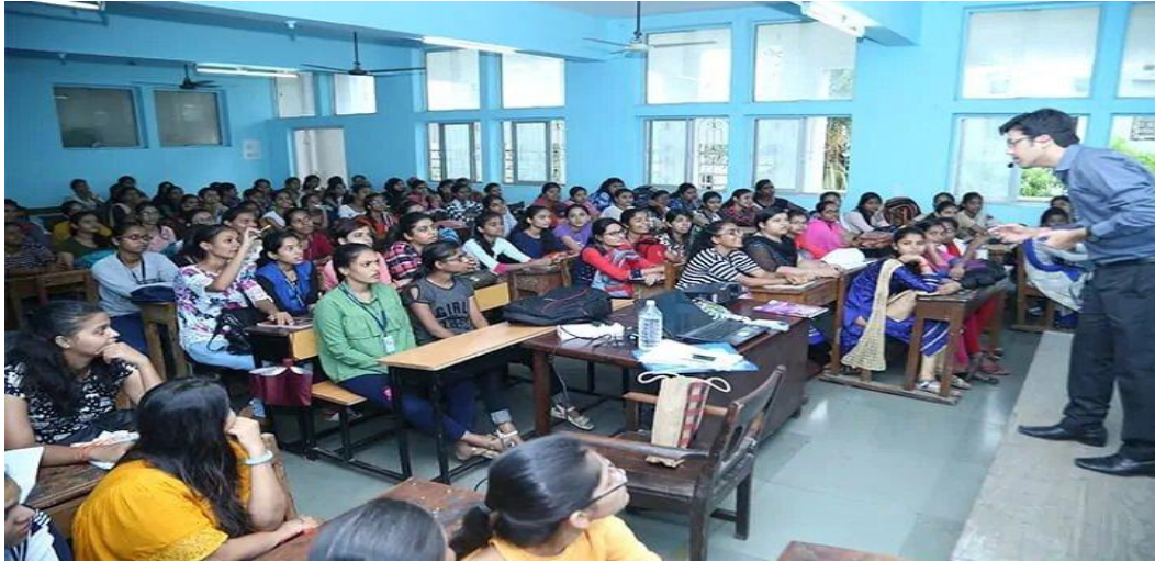
Workshop on GST