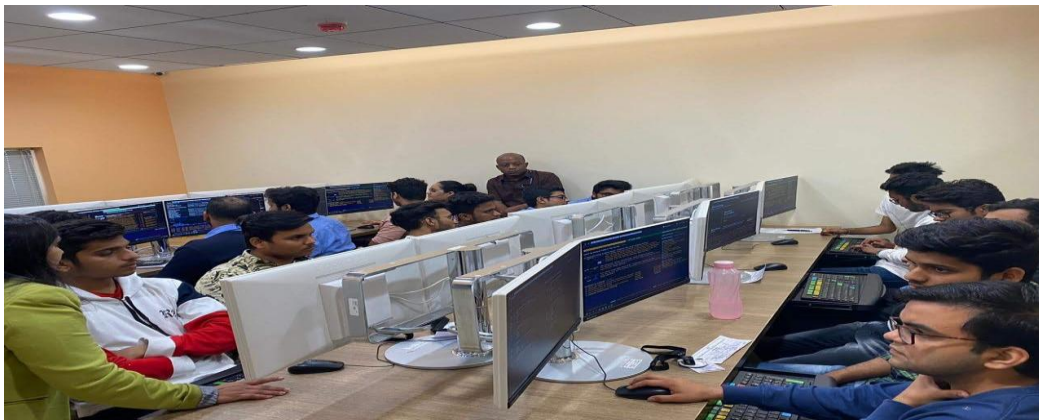
Student attending Bloomberg session

5)Establishment of Bloomberg Lab:- Bloomberg is a U.S. based technology company established in 1981, which delivers accurate business and financial information and which has provided revolutionary financial solutions. Today, Bloomberg has become central nervous system of global finance and a global software platform providing reliable financial information across all market sectors. Bloomberg also has a vertical which opens up the database and knowledge banks for universities. This can help students to access cross-asset, real-time data and historical time series analysis in all financial markets. Students can do real-time studies of capital markets and get the rare opportunity of enhancing their academic knowledge with actual exposure to the practical corporate world. This advantage will also give student added leverage in their career prospects.