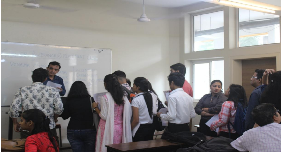
Student participated in Job fair –Vinayak Associate