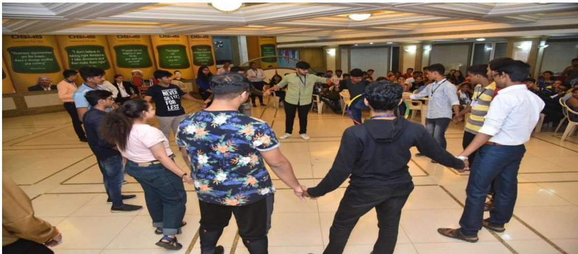
CPLC Management Games