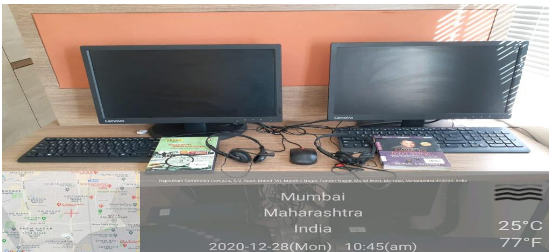
Research cell equipped with Desktop with Earphone and Wifi Connectivity

6) Establishment of Research Cell of the University of Mumbai in the college:-The practice Taking into cognizance the growing importance of research and the need to channelize the research aptitude and skills of faculty members in the College, College has launched a Research Cell of Mumbai University in the College in the subject of Commerce and Economics. Further, the Cell has assisted young faculty members in preparation of synopses for research proposals to be submitted to the University where they are taking admissions to the Ph. D Programme. To promote research culture, the College has encouraged faculty members to participate in Research Conclaves