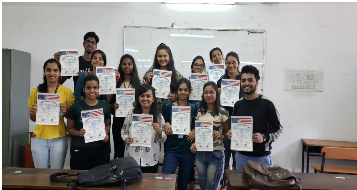
Students of CASI Global Certificate Course posing with their certificates