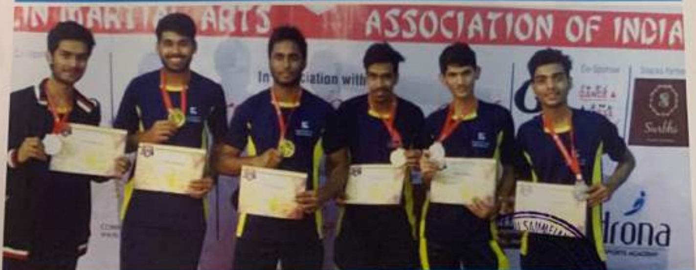
Achievements in Karate Event