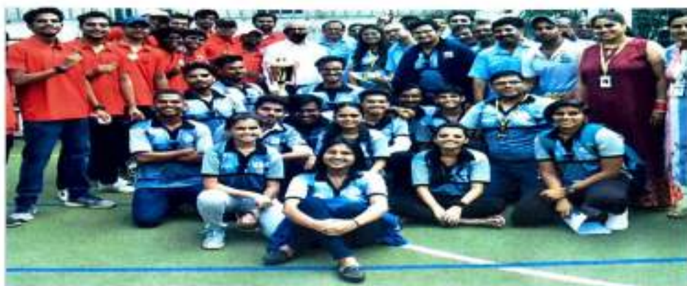
ALUMNI V/S TEACHING STAFF CRICKET TOURNAMENT