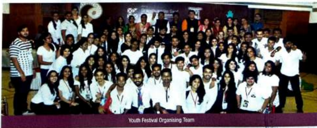
Youth Festival Organising Team

To add cherry on the cake, our Folk Dance team consisting of: