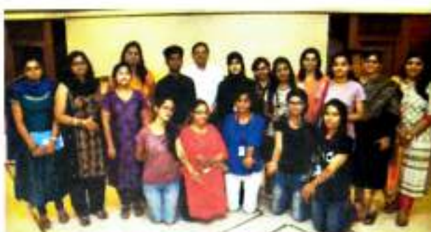
Winners of Mehendi competition posing with judges and team members of Cultural Association

The events were remarkable with the invaluable support of our judges