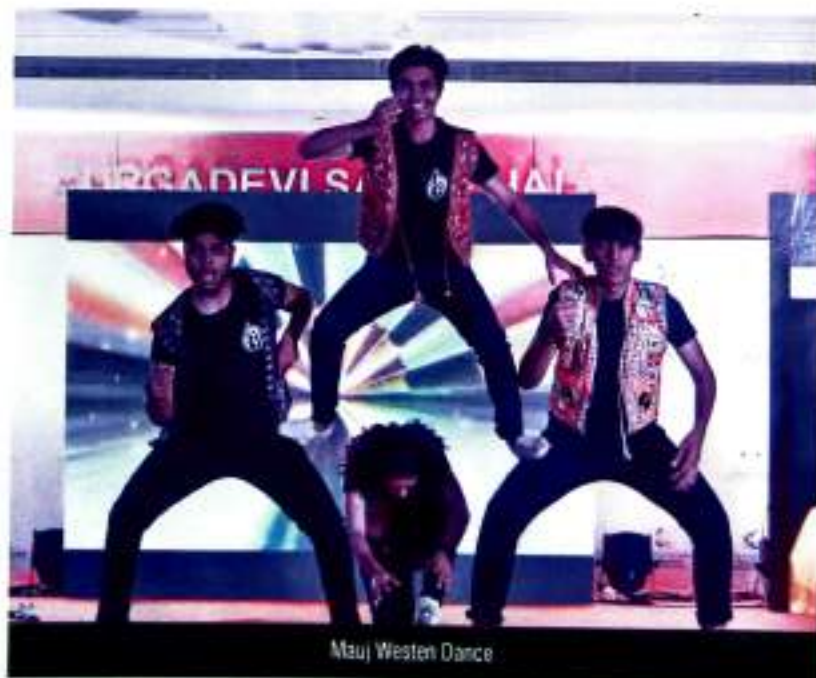
Mauj Western Dance