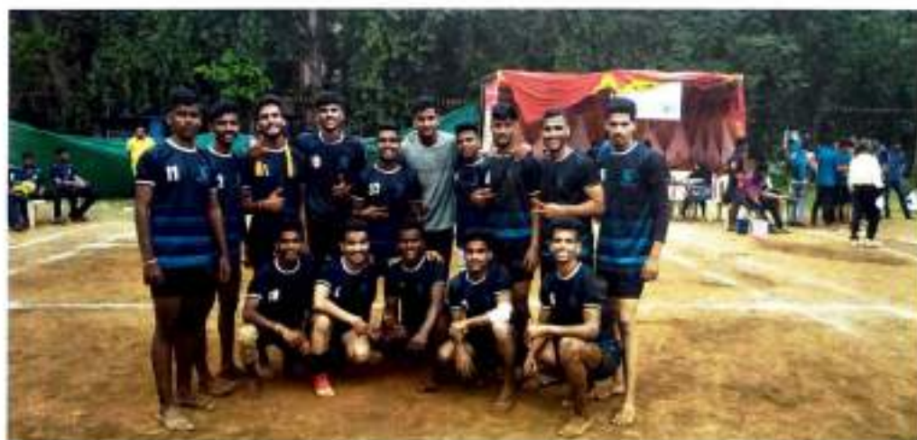
BOYS KABADDI TEAM WON THE FIRST ROUND IN DISTRICT LEVEL