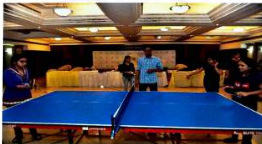
INTRA INDOOR TABLE TENNIS EVENT