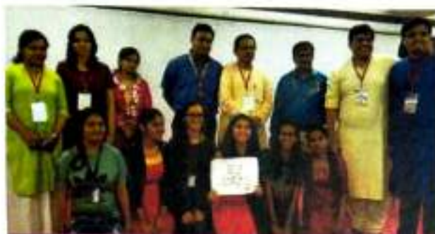
Winners of Antakshari Competition posing with Judges and members of Cultural Association