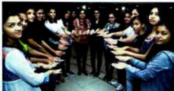
Nail Art Competition