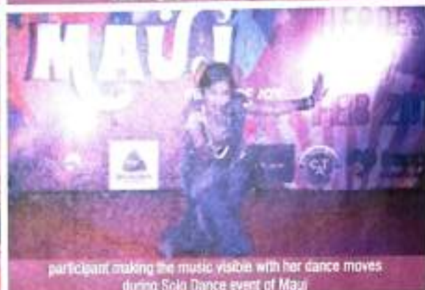
participant making the music visible with her dance moves during Solo Dance event of Mauj