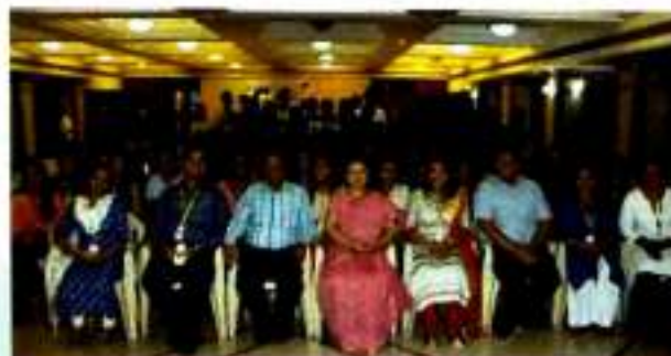
Winners of various events organised by Cultural Association