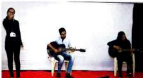
Participant of Singing Competition organised during Talent Hunt Competition