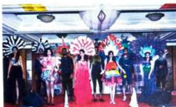
Fashion Show Team putting the stage on Fire with their strong message during Fashion Show event of Mauj