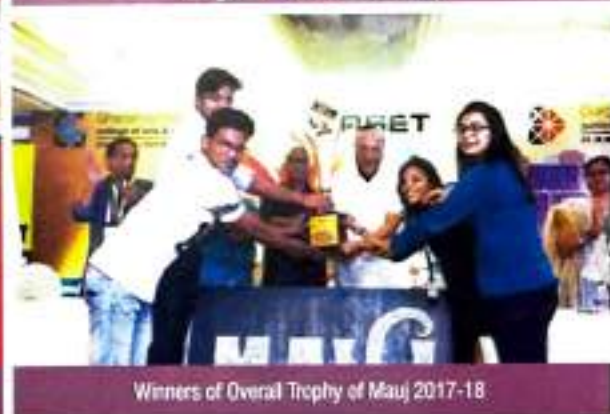
Winners of Overall Trophy of Mauj 2017-18

This year Mauj also received participation from another State – Karnataka for the most glamorous event – Fashion Show.