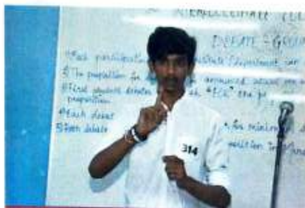
Intercollegiate youth Festival 2017-18 , Debate Competition