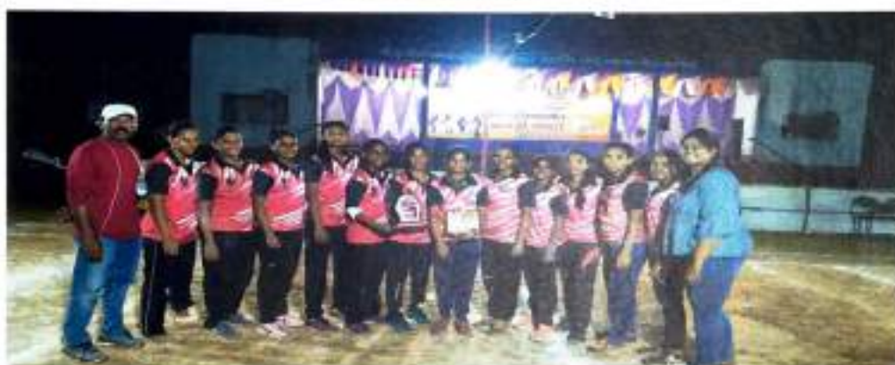
GIRLS KABADDI TEAM WON THE SILVER MEDAL AT STATE LEVEL MATCHES