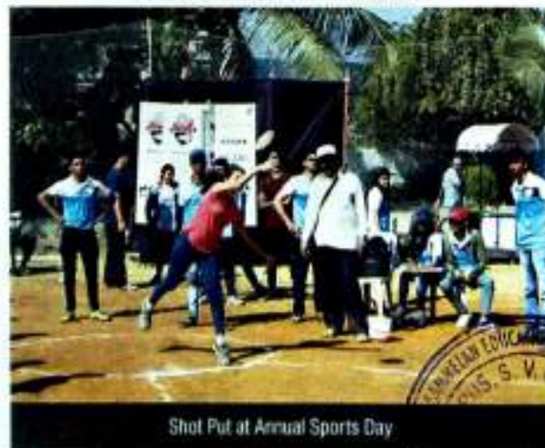
Shot Put at Annual Sports Day