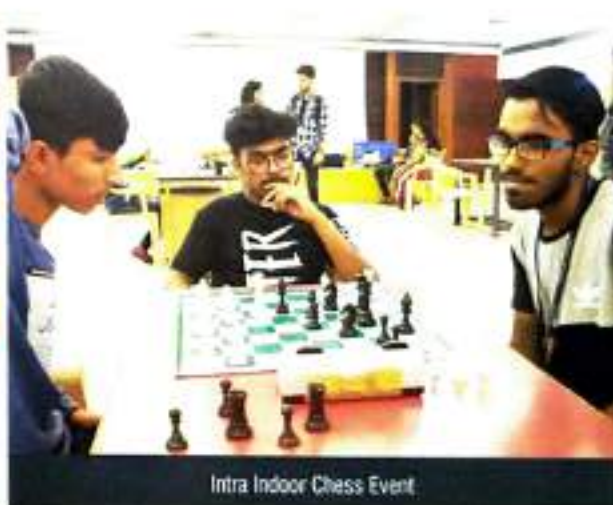
Intra Indoor Chess Event