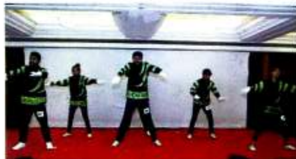
Participant of Talent Hunt Competition - Group Dance