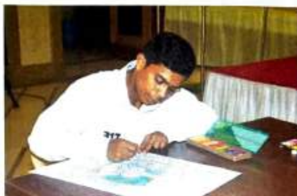
Intercollegiate youth Festival 2017-18 , Poster Competition