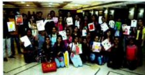
Participants of Greeting Card making Competition posing with their cards