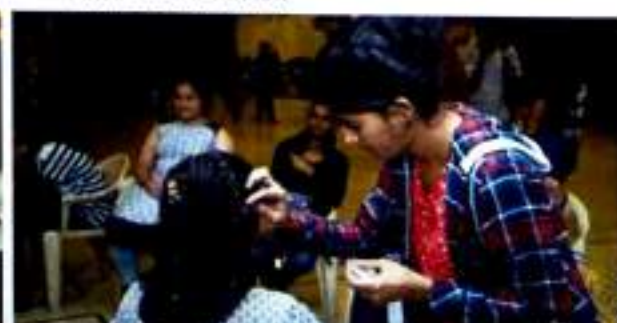
Student creating attractive hairdo during hairstyling competition