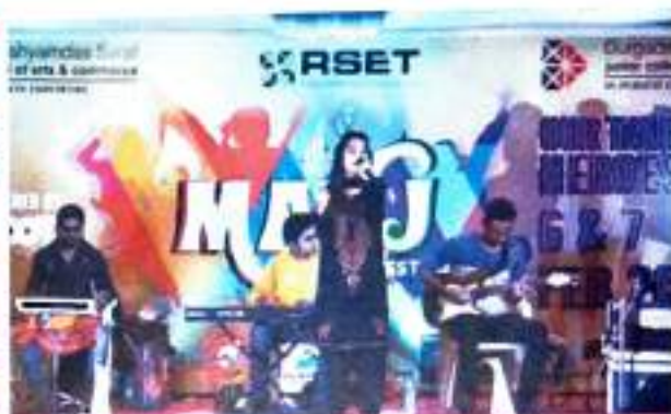
Participant singing with her heart and soul during Solo Singing competition under Mauj