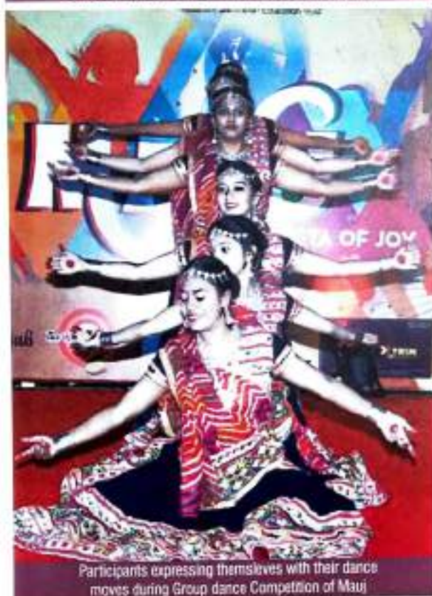
Participants expressing themselves with their dance moves during Group dance Competition of Mauj